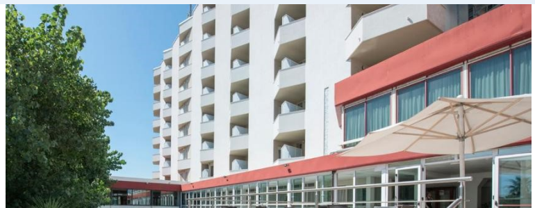
Grand Hotel Adriatico—Montesilvano